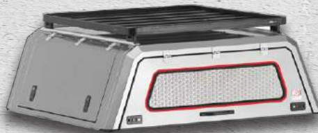
ANTI-THEFT REAR DOOR MESH