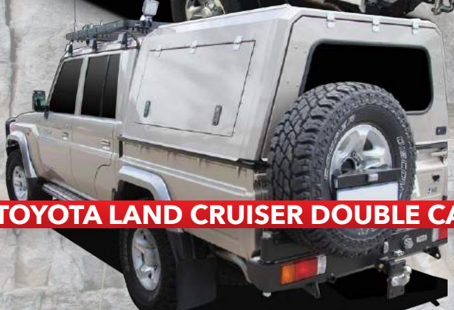
TOYOTA LAND CRUISER DOUBLE CAB