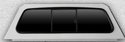
FRONT PANEL CAB SLIDER WINDOW