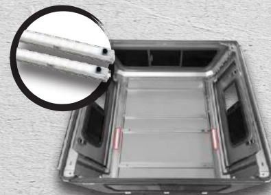
2X INTERNAL LED LIGHTS