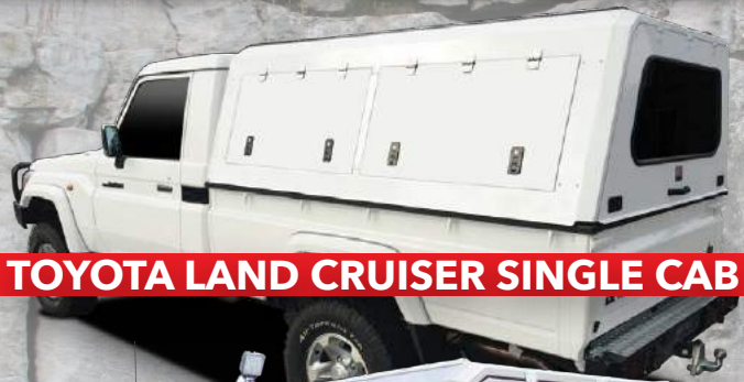
TOYOTA LAND CRUISER SINGLE CAB