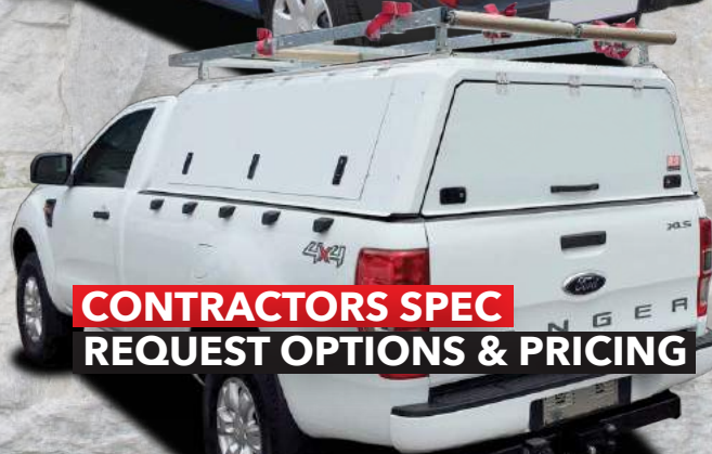
CONTRACTORS SPEC REQUEST OPTIONS & PRICING