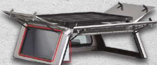
INTERNAL KITCHEN UNIT